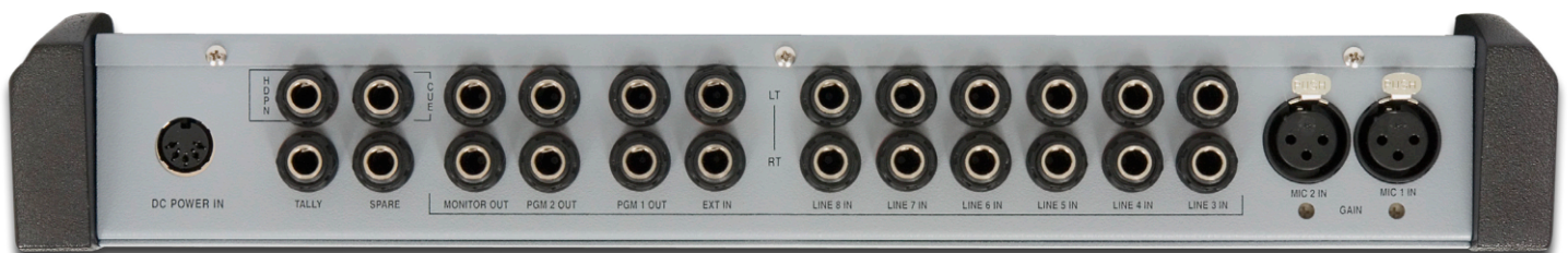
Rugged Tabletop Mount with Direct Access TRS Rear Connectors

Front panel LED between the meters, and a relay output to drive an external ON AIR light. Activates when a mic channel is ON and enabled for monitor mute.